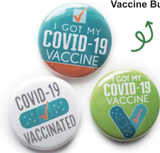
Vaccine Button Badge

After getting their COVID-19 vaccine, recipients will be pleased to receive this lapel pin indicating their vaccination status.