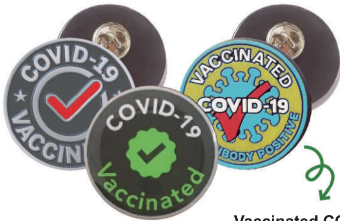
Vaccinated COVID-19 Lapel Pin